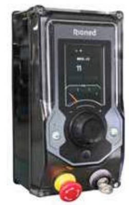
eControl+ control panel