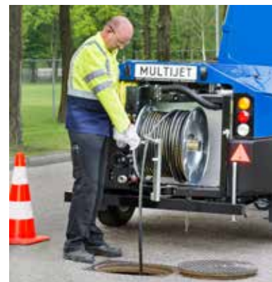
800 litres water on board